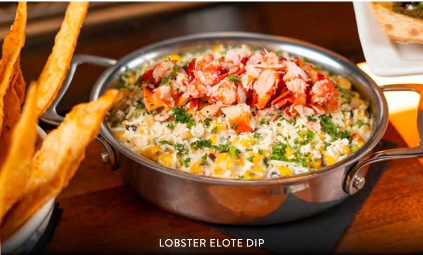
LOBSTER ELOTE DIP