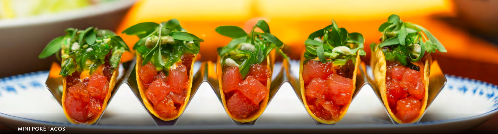
MINI POKÉ TACOS