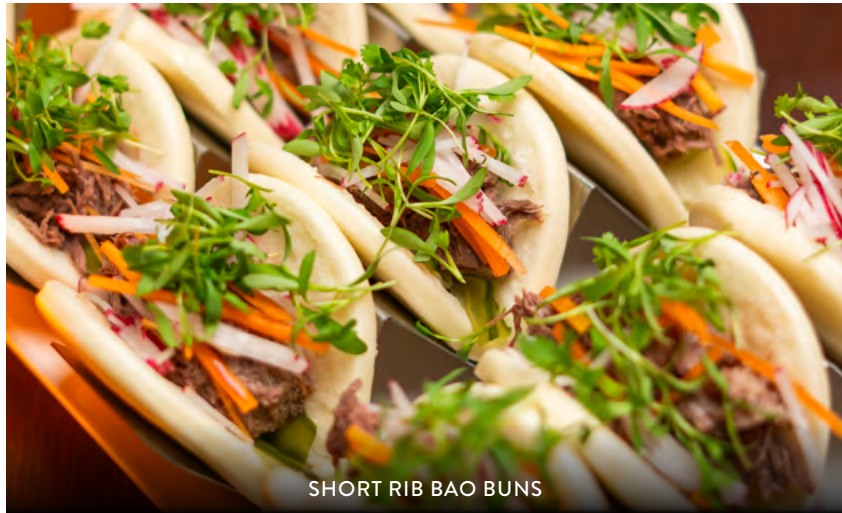
SHORT RIB BAO BUNS