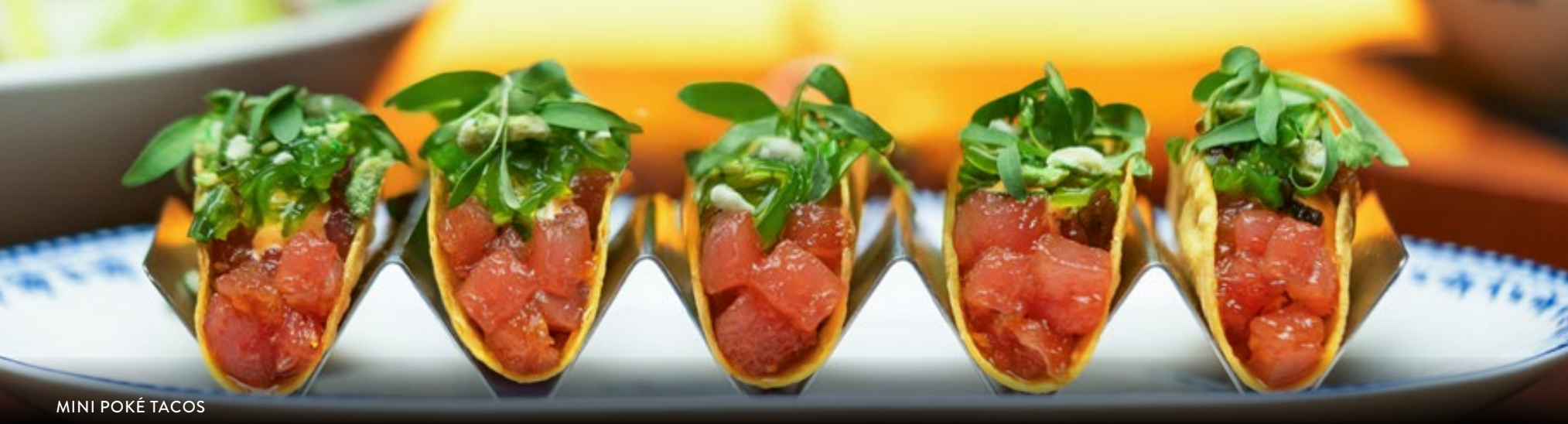
MINI POKÉ TACOS