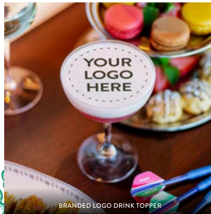
BRANDED LOGO DRINK TOPPER