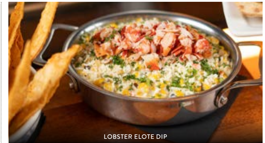
LOBSTER ELOTE DIP