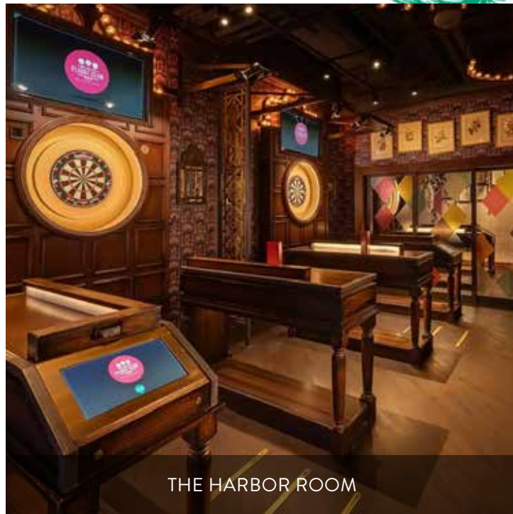
THE HARBOR ROOM