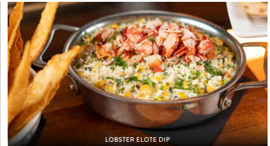
LOBSTER ELOTE DIP