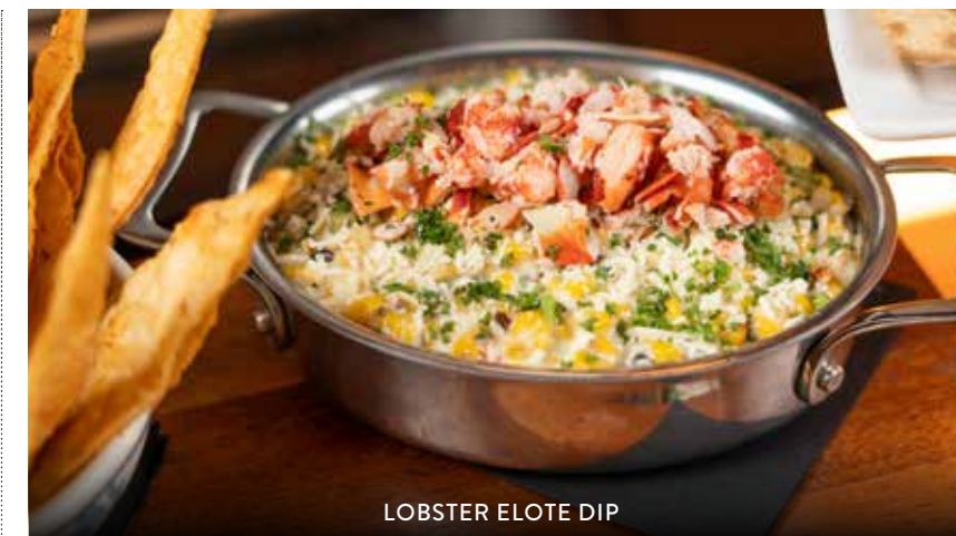
LOBSTER ELOTE DIP

DESSERT TOWER V ..... 55 Mini Lemon Tarts, Assorted Cookies, Mini Cannolis