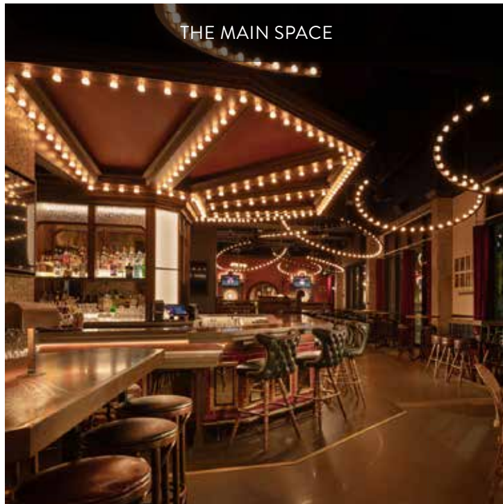
THE MAIN SPACE