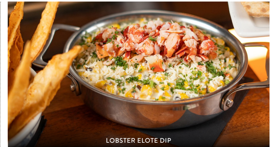
LOBSTER ELOTE DIP

DESSERT TOWER V 65 Mini Lemon Tarts, Assorted Cookies, Mini Cannolis